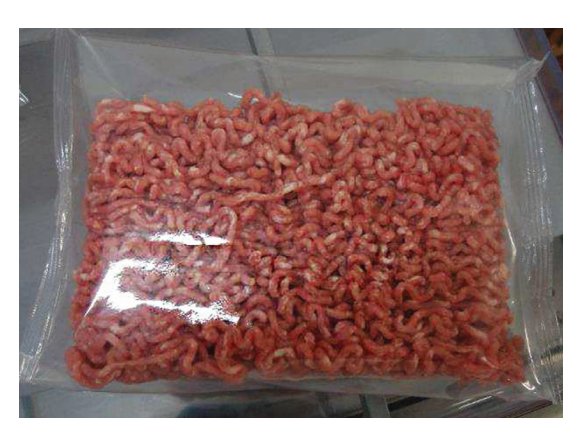
Introducing a clean, fresh, eco-friendly packaging option for ground meat