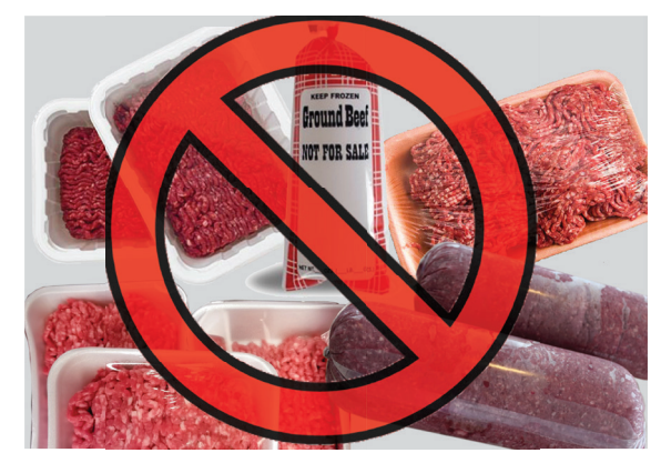
Reduce the unnecessary packaging such as foam, plastic, and clips

In developing efforts to create a more sustainable package, we are able to eliminate up to 60% of the additional contents that go along with your standard ground meat packaging. Material such as metal clips, foam, plastic, and/or cardboard trays are no longer needed to provide an attractive, cost effective, and space saving package. With 50% less space on a truck, the system provides 100% increase in shipping capabilities, storage, and valuable shelf space.