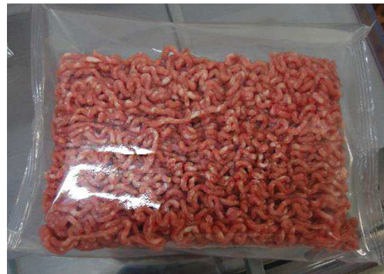
Introducing a clean, fresh, eco-friendly packaging option for ground meat