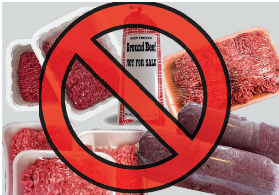
Reduce the unnecessary packaging such as foam, plastic, and clips

In developing efforts to create a more sustainable package, we are able to eliminate up to 60% of the additional contents that go along with your standard ground meat packaging. Material such as metal clips, foam, plastic, and/or cardboard trays are no longer needed to provide an attractive, cost effective, and space saving package. With 50% less space on a truck, the system provides 100% increase in shipping capabilities, storage, and valuable shelf space.