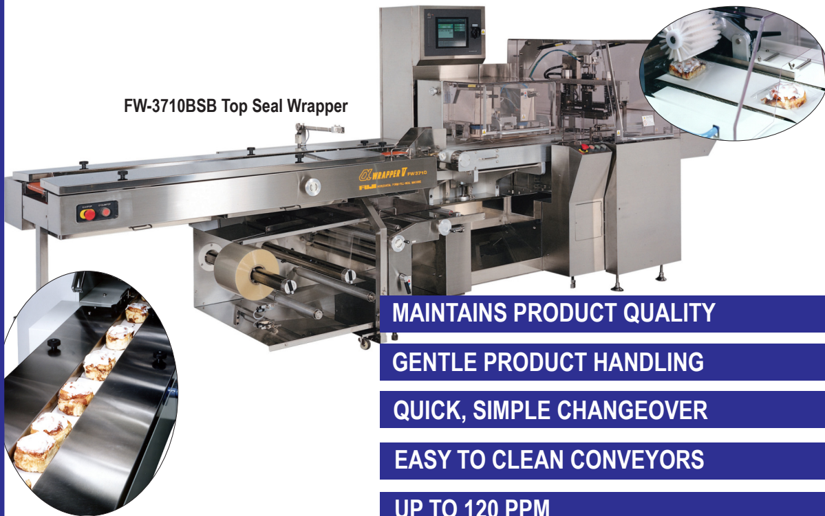
FW-3710BSB Top Seal Wrapper