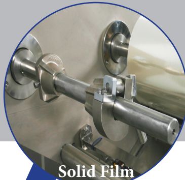
Solid Film Spindles