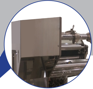
Slanted Surfaces for Better Runoff