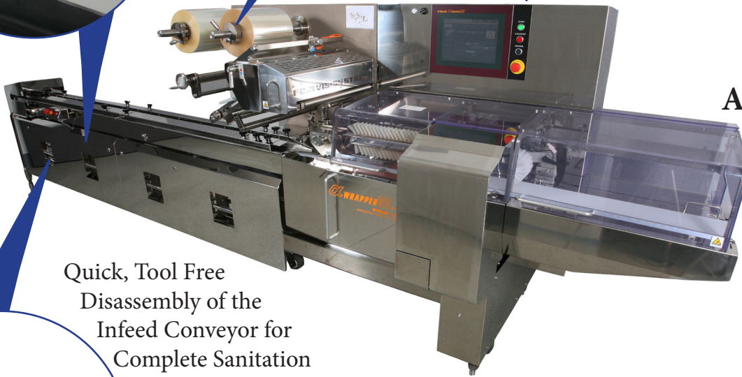
Alpha VII FW3700SD

Quick, Tool Free Disassembly of the Infeed Conveyor for Complete Sanitation